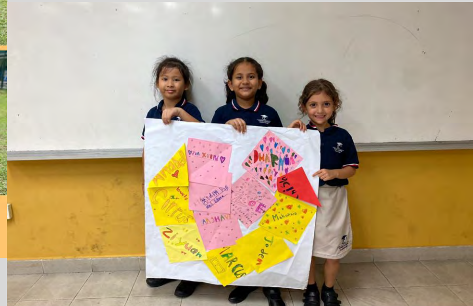
HEART TILE CLS AESTHETIC & CREATIVE EXPRESSION