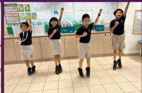
ALESSO, TOVE LO - HEROES (WE COULD BE) CLS OUTDOOR ENGAGEMENT EDUCATION - DANCE