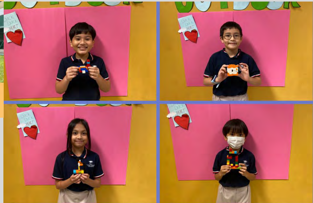
LEGO HEALTH MACHINE CLS BUILD YOUR LEGO