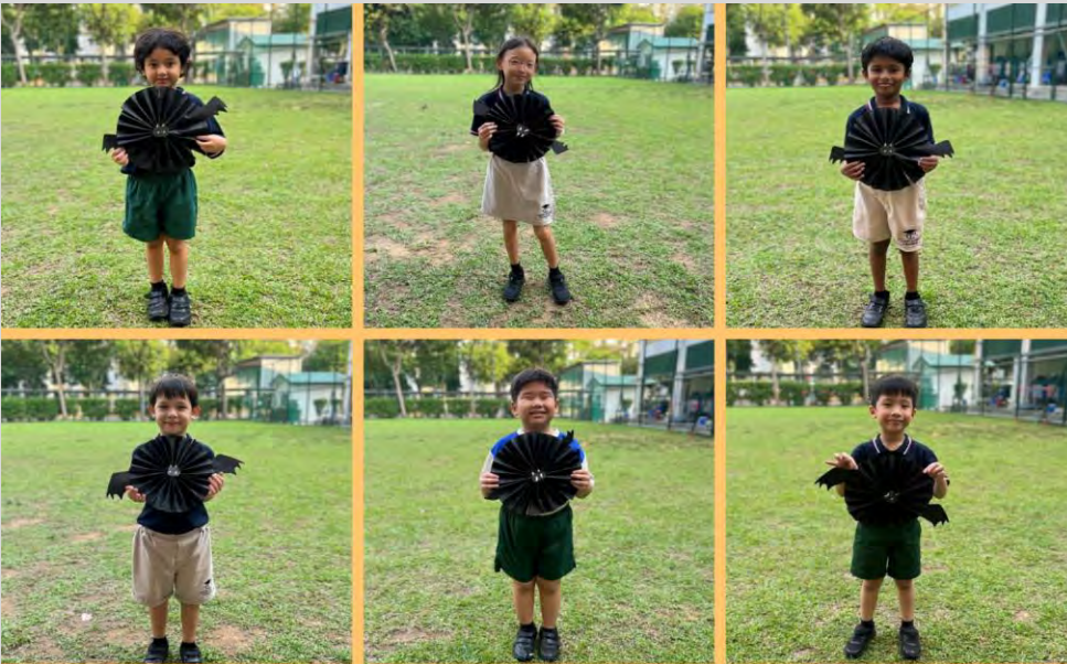
ROSETTE BAT CRAFT CLS AESTHETIC & CREATIVE EXPRESSION