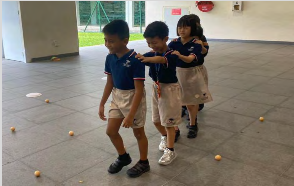
MINEFIELD CLS LEADERSHIP PROGRAMME