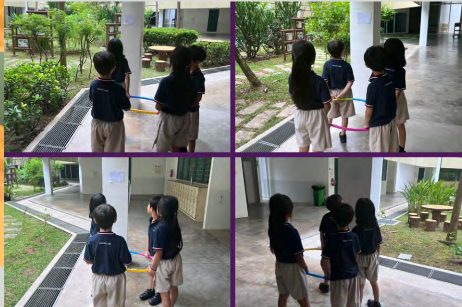
FINDING YOUR HEROES CLS CHARACTER DEVELOPMENT PROGRAMME