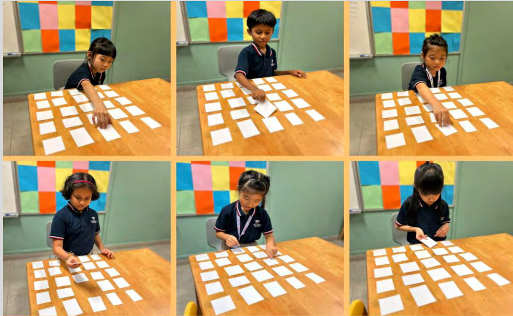
MEMORY GROUP GAME CLS CHARACTER DEVELOPMENT PROGRAMME