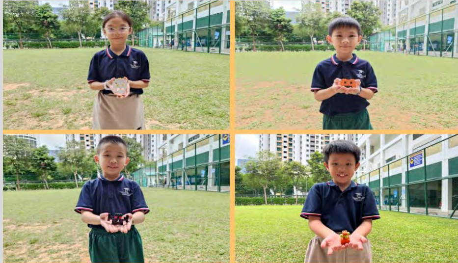
LEGO TRICK OR TREAT CLS BUILD YOUR LEGO